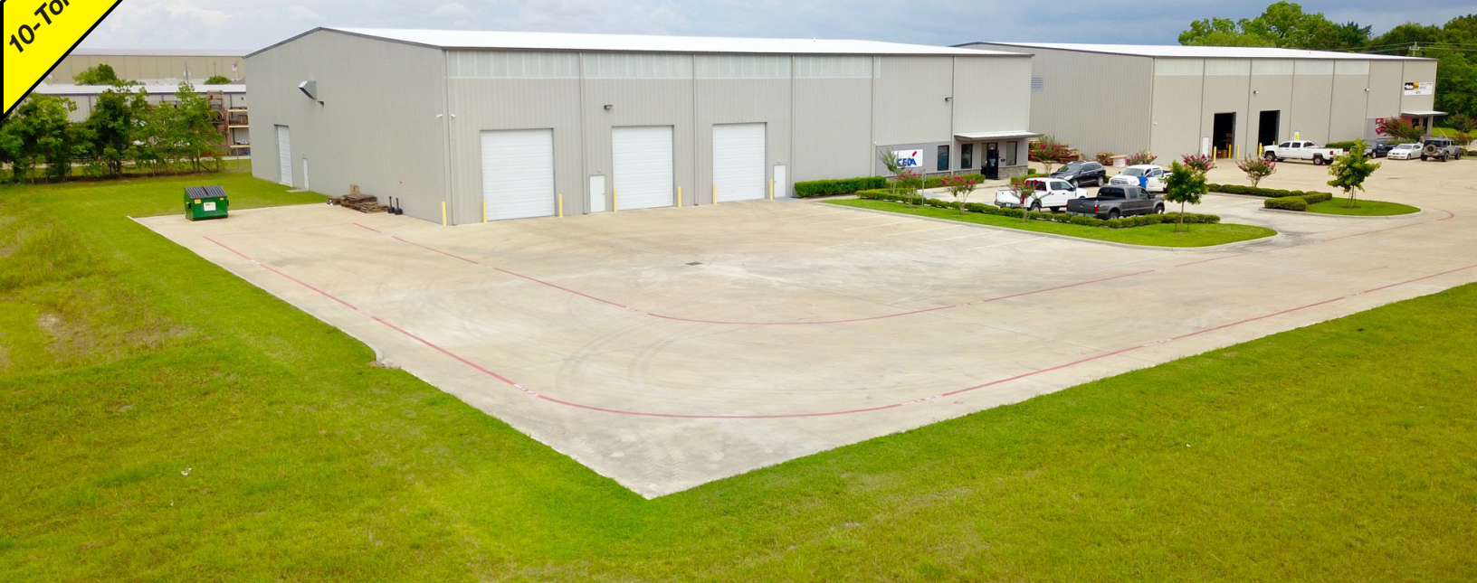
Phase I of Existing Development Featuring One Remaining Freestanding Crane-Ready Building